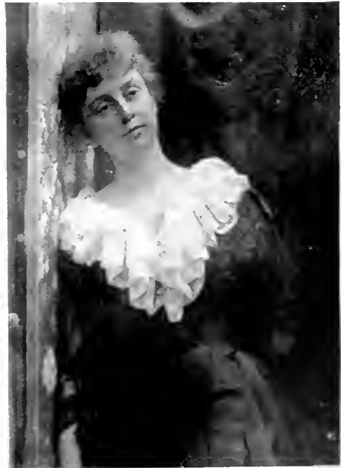
KATE DOUGLAS WIGGIN.

story was a short serial, entitled "Half-a-Dozen Housekeepers," which appeared in "St. Nicholas." For many years she wrote no more for publication, except in connection with kindergarten work. Her "Story of Patsy" was written and printed for the